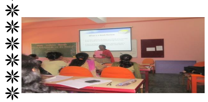
CAP (CENTRAL ASSESSMENT PROGRAMME ) 米

\mathbf{*} Book Review workshop was conducted on 3<sup>rd</sup> January 2014. To develop reading skill and critical evaluation, book review was introduced in the \mathbf{*} B.Ed. curriculum from this year.